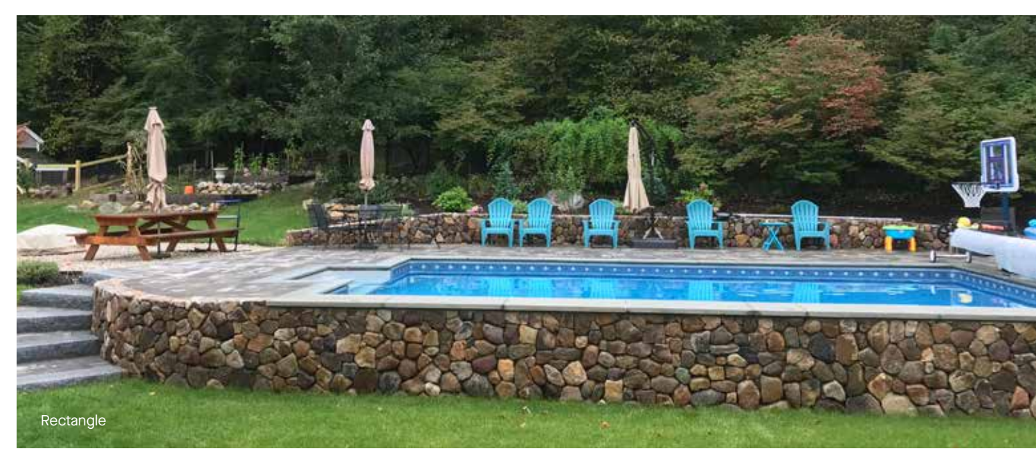
Is your backyard on a hill? Sloped terrain is no longer a problem! Whatever your landscape, there's a Premier Pool to fit your yard!

Insulated Wall System Semi-Inground Pools Premier